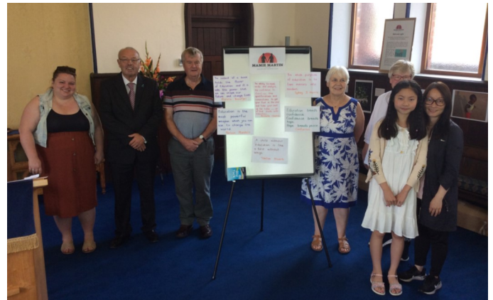
The readers of quotations on the importance of education by some famous people

Quotations include the Mamie Martin motto “Educating Girls, Empowering Malawi”