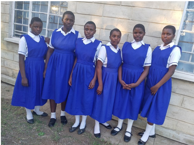
Lancashire West girl

They all are very grateful and appreciate the help that they are getting.