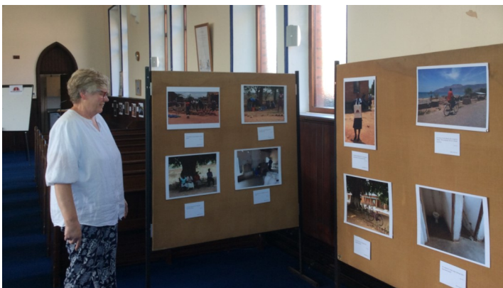
Here are some photographs of the exhibition within Croston church including Our Lancashire West Girls.

The exhibition was included in a special Own Arrangement Service on 24 July which included various videos from Mariot, Mamie’s granddaughter, Blandina, one of our Lancashire West Girls. The videos were shown at several times while the exhibition was in Croston (22 Jul to 2 Aug) During the service the Malawian Song / Melody Dzuma Lapita was given a rendition too. This is number 145 in Singing the Faith if you too fancy giving voice to it! It was used in reflective time within the service .